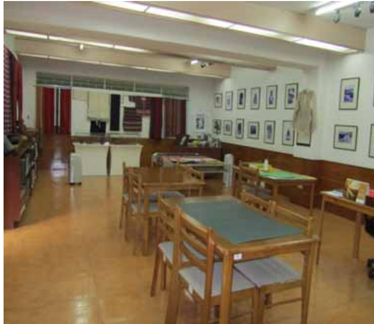
Figure 3: The Cordillera/Northern Luzon Historical Archives

With the vision of the UP Baguio to become an academic institution devoted to the development of Cordillera studies, the archives is seen as a means of achieving this vision of the parent organization. The archives' mission, aside from being a repository of primary sources on the Cordillera, aims to collect as humanly possible all known sources written on the Cordillera. The archives is seen, therefore as a means to achieve the vision of UP Baguio.