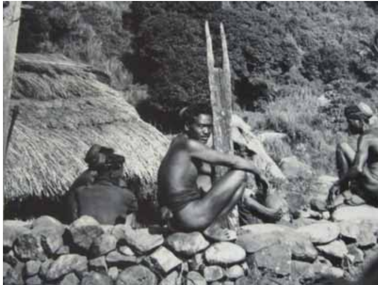
Figure 5: Photo collection of Laurence L. Wilson

In the short write-up of Dr. Salvador-Amores on the photos (2001), she notes that when the photos were discovered in a pile at the library, these were stapled together and mislabeled. Some of the photos and letters were mounted on scrap papers, making the annotations at the back of the photos hard to read or were altogether unreadable. The photos were in varying states of deterioration and were badly in need of preservation.