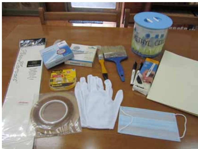
Figure 13: Archives preservation supplies