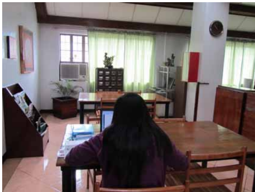
Figure 2: The Cordillera Studies Collection Library

The Cordillera Studies Collection Library traces its history to the establishment of two libraries in the academic community of University of the Philippines Baguio under two different organizations. First, the Cordillera Section of the Main Library's Filipiniana Section and a Library under the Cordillera Studies Center, the research and extension arm of the Social Sciences Division, now the College of Social Sciences. With their aim of acquiring information sources on ethnography, ethnology, communication, language and literature, ancestral land issues and other related fields of interest that focused on relevant issues specific to the highland communities of the Cordillera Region, the two libraries were in fact duplicating functions and collections.