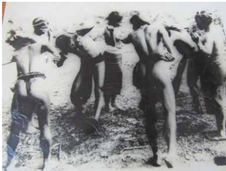
Figure 4: Photo collection of Laurence L. Wilson

Detailed in the photographs are the ordinary lives of the Cordillerans before the coming of the Spanish colonizers: native clothes and adornments, tattoos on skin, economic activities – like farming and agricultural activities, mining, weaving, gold panning –, native houses and abodes, rituals and festivities and burial caves. Also widely photographed are Baguio and its environs at the turn of the 20th century and political figures who governed the then Mountain Provinces as well as notable individuals who made enduring contributions to the early history of the region. Along with the photographs are film negatives, which upon close examination reveal images of individuals clad in native clothes and bearing spears and shields, bululs , skulls and rice terraces.