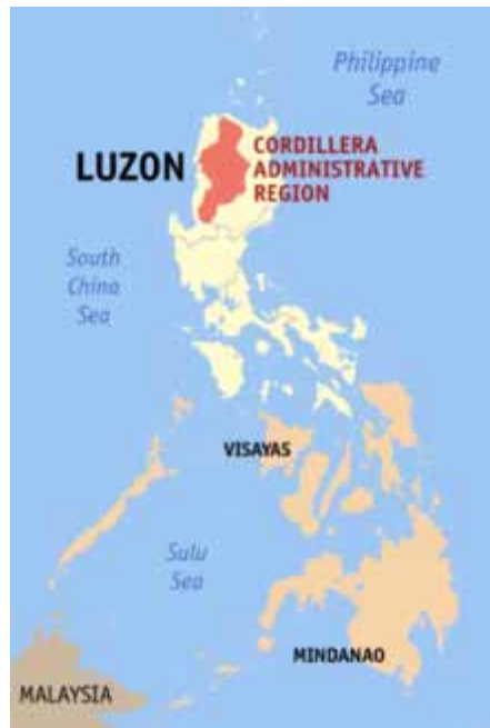
Figure 1: Map of the Philippines

ey, Ibaloy, Ifugao and Bontok. It has the second largest concentration of indigenous groups of people, next to the island of Mindanao. The geographic condition of the region earned them the collective name Igorots, from the Spanish word Igorrotes which means “of the hill or mountain.” Partly due to its rugged terrain and largely to their resistance, the inhabitants of the region were not easily subdued by the Spanish conquistadores of the 18th century (Scott, 1977). They resisted efforts by the Spanish government to put them under their control. For this, they were regarded uncivilized, infielos (pagans), fierce and barbaric. Their non-assimilation into mainstream Spanish rule made the Cordillerans adhere to a society free of Western influence.