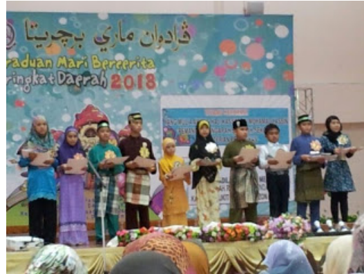
Brunei Darussalam: Annual Storytelling competition

In schools in Brunei Darussalam, students read every morning during registration and sometimes for the first 10 minutes of class. Children from the same year get to swap books around as well. The Read Book Swap is an open group started by volunteer youths. This year a Free Library in a busy shopping Mall was opened.