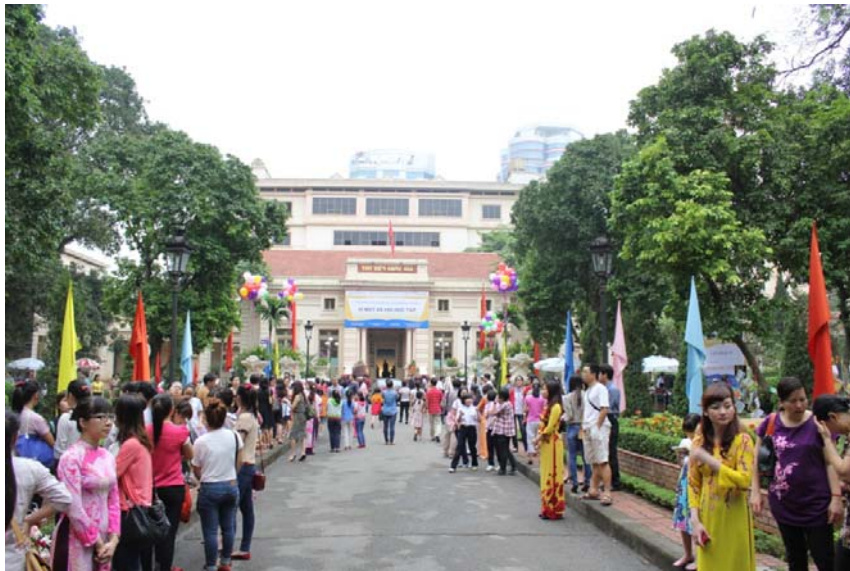
National Library of Vietnam : Annual Reading Festival

As librarians, we know that citizens need to use information to help them make informed decisions in their daily lives. They need to learn to read, to find information that they need, and they need to learn to distinguish between useful and less useful information. Promoting reading and information literacy skills are what libraries in SEA strive to do for the citizens of the countries they are in. This takes many forms. The most common programme that a number of SE Asian libraries carry out regularly is a National Reading Programme that promotes reading in the country. Some of these take place over a month, and some are year-long programmes organised jointly with many partners. Below please see an image of a reading festival organised by the National Library of Vietnam.