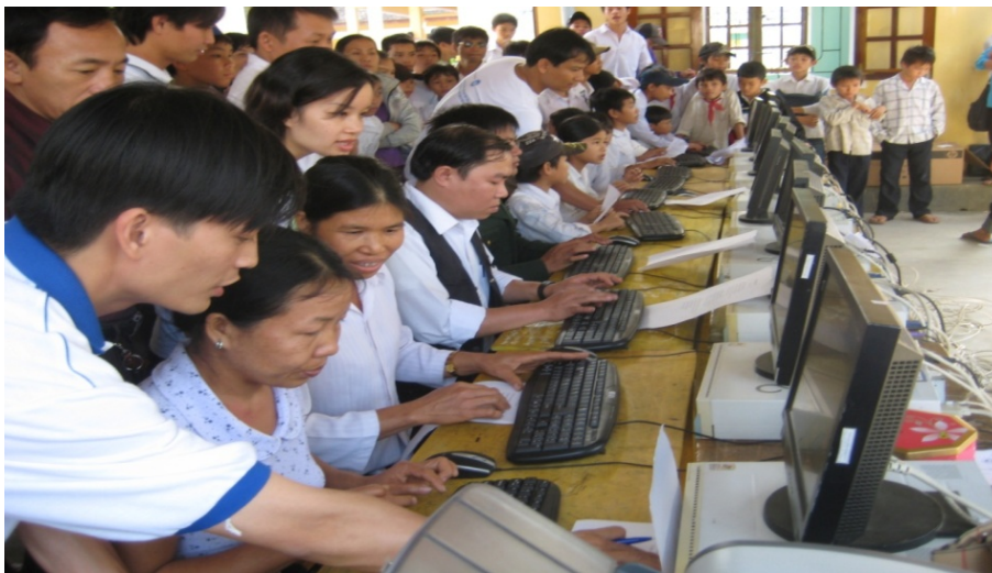
Vietnam: Internet Festival 2011

By opening libraries to everyone who lives in the country, libraries in SEA play a critical role in allowing bonding of citizens and residents in the nations. This is one of the most important intangible benefits of libraries which sometimes may be overlooked by both politicians and citizens.