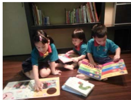
Family library in Brunei Darussalam

Public library services in Brunei Darussalam are provided through community and branch libraries, mobile service points, bulk loans, reading corners and family libraries by the Dewan Bahasa dan Pustaka Brunei.