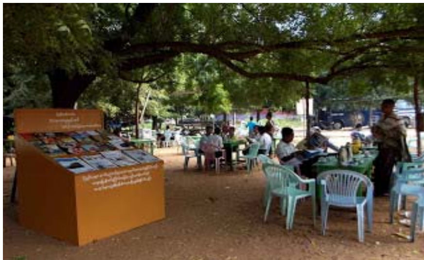
Myanmar : Book corner at bus stop

A few countries do not have sufficient budgets from the government to support them in their endeavour, and they depend on Non-Governmental Organisations (NGOs) to help them set up and run libraries. For example, Laos set up 280 libraries and reading rooms, supported by NGOs. Many of the collections are also donated by NGOs. Plans have been made to set up 50 school libraries, again supported by NGOs in the country.