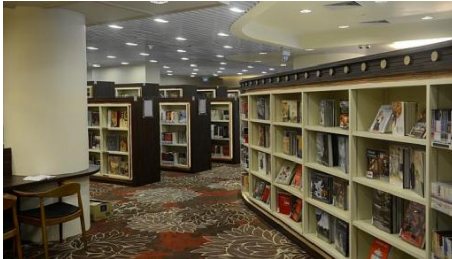
Singapore : library@Chinatown, manned by volunteers on most days

to run it for 5+5 years. Volunteers from the community signed up to work at the library on shifts, and this library has been providing its services to the general public using this model for some months now. It is a living example of how when the public, private and people sectors come together, they can achieve new possibilities.