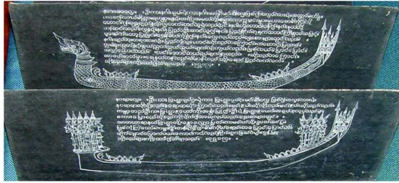
Myanmar : rare parabeik (folded paper book)

Recently, the NL of Philippines initiated a new project to ensure that across the country, heritage materials are systematically collected and preserved. They have started the Philippine Registry of Cultural Properties and this includes all materials that are found in the different types of cultural institutions across the Philippines.