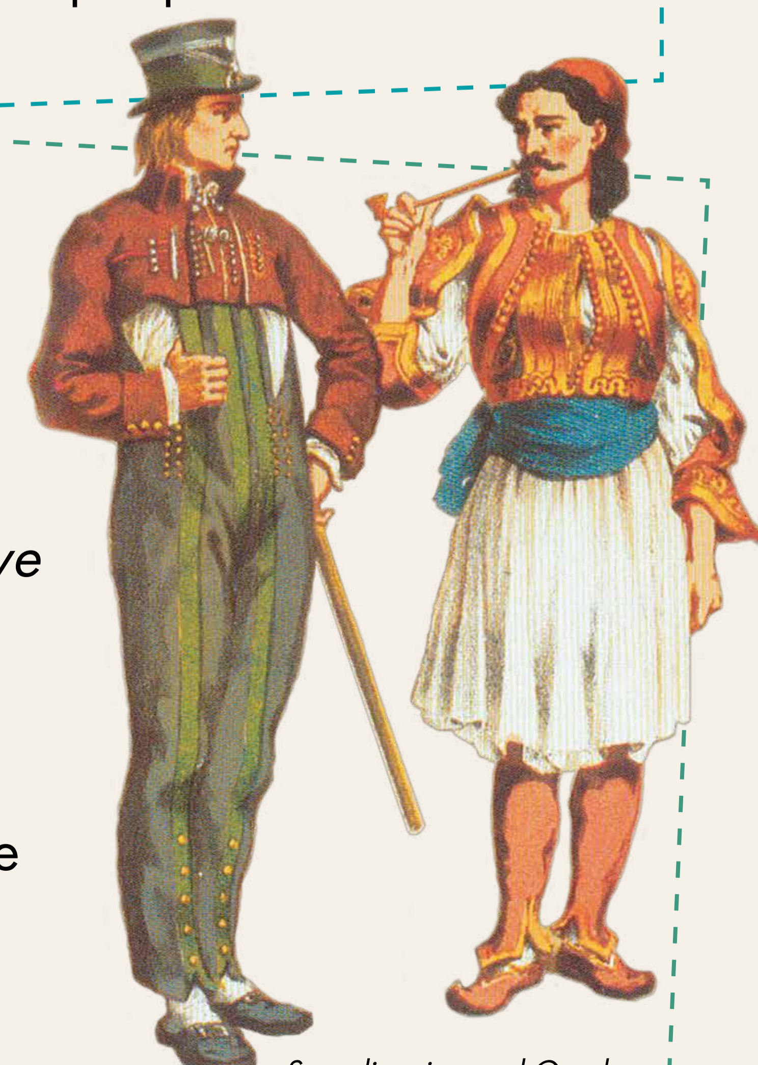
Scandinavian and Greek, Hand painted lithography. Private collection