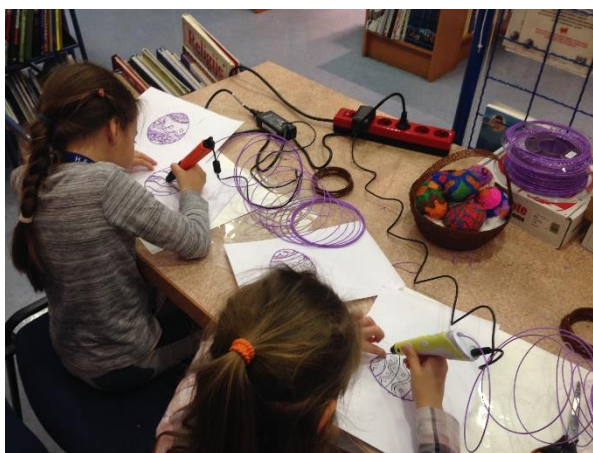
3D-pencil workshop in Medioteka of the City Library

In 2018 there were 108 workshops with 653 individual users.