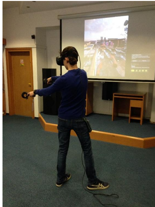
VR workshop in Medioteka of the City Library

The VR is placed in Medioteka of the City Library. A virtual reality workshops are intended for kids older than 12 years and adults and are currently being held on school breaks. With VR workshops in Medioteka of the City Library there are also AR (augmented reality) workshops, which uses an overlay of the real world and adds objects to it. The AR workshops are held in cooperation with The American Corner on iPads that have installed Quiver 3D Augmented Reality coloring apps and are intended for kids from 6 to 10 years.