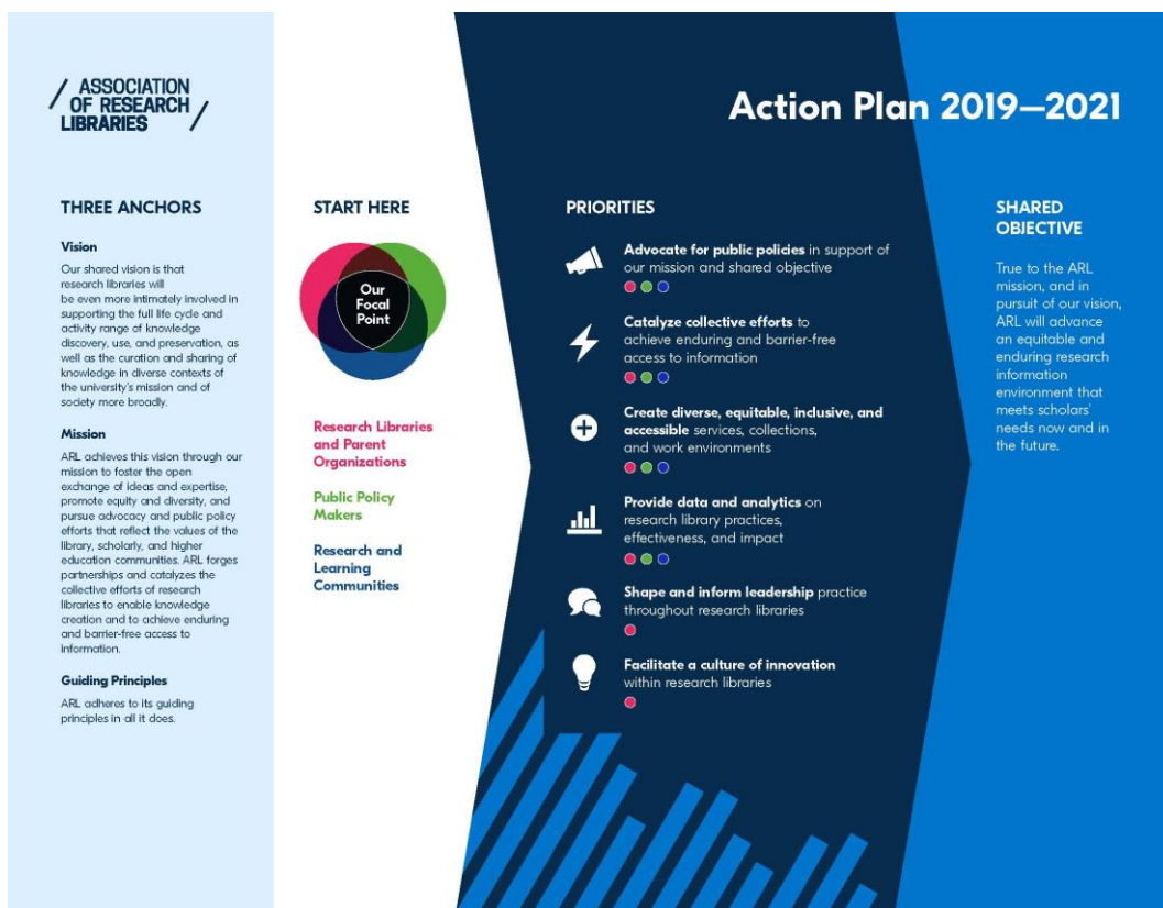
Figure 2. ARL Action Plan Infographic.

ARL focuses its programs and initiatives on the intersection of institutional, public policy, and research and learning community relationships that determine research policy and practice, and more specifically the role of research libraries in advancing both.