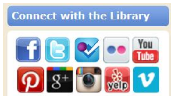
Figure 2 – Screenshot of UHM Library Social Media channel icons, created as a Libguides, recommended for use in subject guides x

Furthermore, promotional items such as flyers and bookmarks produced by LC about Chronicling America were heavily distributed. These items were available at various reference desks in the UHM Library and were included in orientation packets for incoming students and visiting groups. The visually appealing bookmarks and its varying subject coverage were an attractive, free take-away to market an important resource. Those working on promoting Chronicling America plan additional efforts to make a HDNP specific bookmark available, as well as other promotional presentations to the general public (especially those outside UHM).