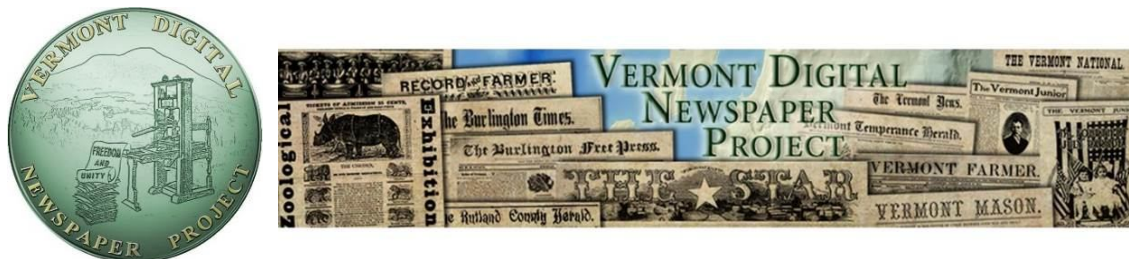
Figure 3 VTDNP Logo and Banner designed by K. Heather Kennedy

On the Internet, VTDNP has a website xiv , WordPress blog xv , and Facebook page xvi . The project also created a branding package that included a logo, banner, and VTDNP bookmark (see figure 3 below) to accompany Chronicling America bookmarks produced by LC.