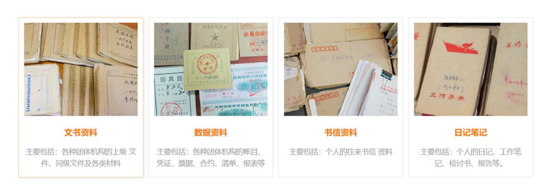
The Contemporary Chinese Social Life Resources collected by Fudan

Next the coalition will focus on sharing private letters whose owners had been marginalized for a long period of time. Fudan library will further upgrade the contents and multilingual pages, as well as digital database construction so as to serve scholars all over the world. It will contribute to the development of history, sociology, politics, anthropology and other disciplines. Of course, we are also equipped with legal experts to deal with correspondence-related issues with the relevant laws of China and the international community.