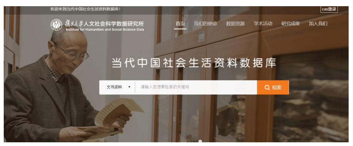
The Contemporary Chinese Social Life Data Platform established by Fudan