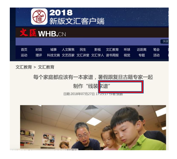
The Case: Promoting Family Genealogy for Community

From the academic point of view, the boom of revising genealogy has its special significance. Some people might think that the kinship power is declining continuously, and will be replaced by the individualistic and civic new type of social contract. But more and more clans began to emphasize the cultural connotation of clan and try to "revive the kinship", hence they would pay special attention to the compilation of "clan tree". While the young people in the clan mainly regard the kinship ties as individualizing social resources, so they are also interested in the big names of the clan and pay more attention to the members' "address book", in order to get help or advice through consanguinity.