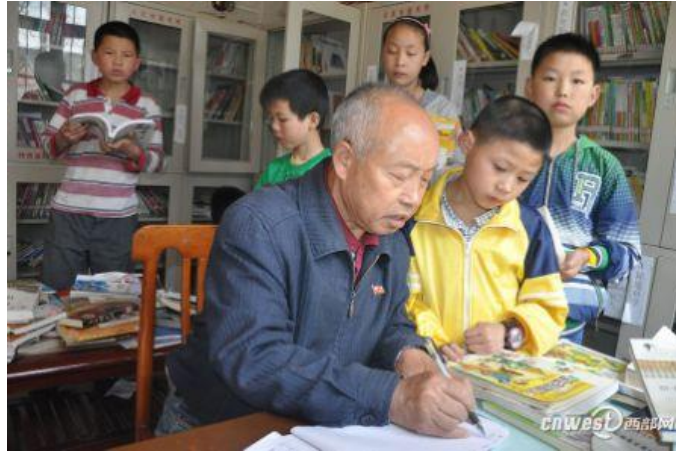
Figure 4. The librarian guiding rural children to read in Chuanwen Library (A rural non-government library in Shanxi Province)