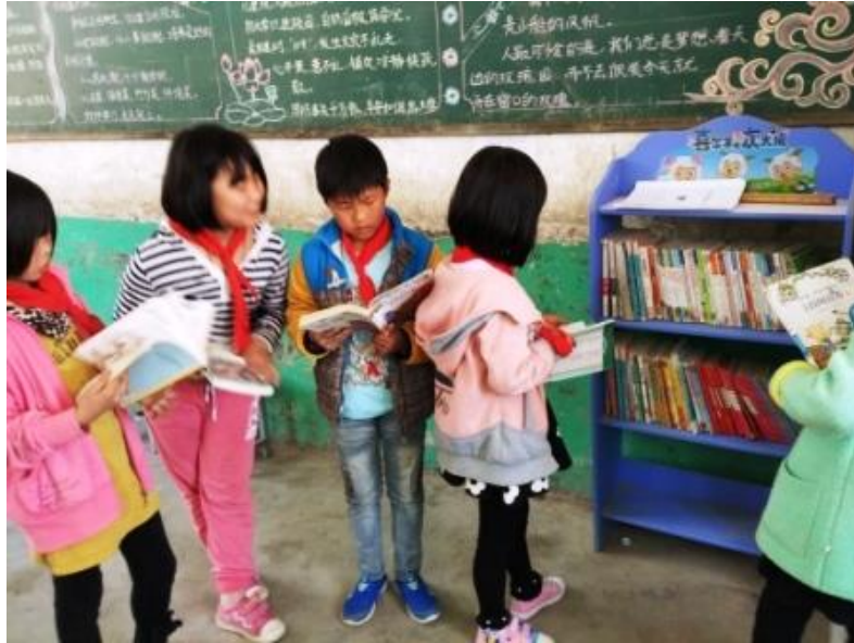
Figure 3. A book corner in the classroom of Grade 3 in Ningzhuang Primary School (School Book Corner Project in Henan Province)