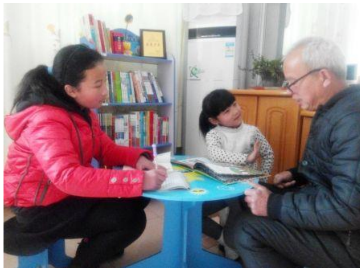
Figure 2. Grandpa Liu reading with together his two granddaughters (Home Bookshelf in Hebei Province)

So-called “Literary families” are emerging in the villages (Figure 2). The scene of a literary family was shown as following: a small blue bookshelf is placed in the cleanest and brightest place of the house; a younger child is reading a picture book with mom; an elder child is reading independently instead of watching TV; and grandpa is having fun with a book titled Five Thousand Years of Chinese History . The home bookshelf in daily life is not only creating a stronger reading atmosphere but also enhancing family members’ mental attitude.