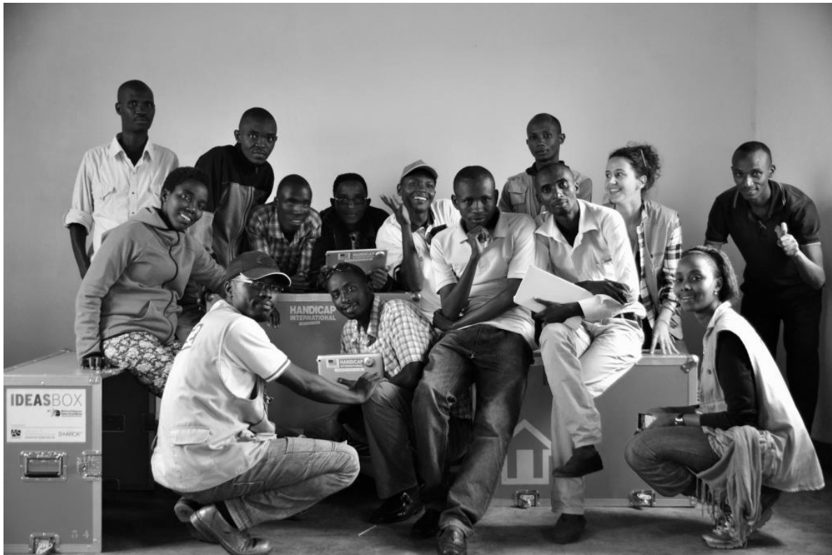
Figure 4: The facilitators of the Ideas Box deployed in the Mahama refugee camp (Rwanda) with Handicap International and their trainers from Libraries Without Borders