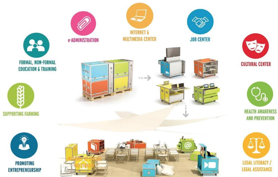
Figure 1: Presentation of the Ideas Box and its multiple uses