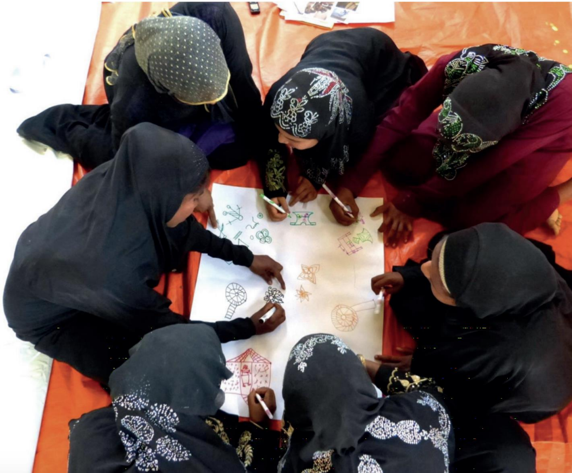
Figure 3: Design thinking workshops aiming at defining content for the Ideas Box, with Rohingya women in Bangladesh

Ideally the focus groups facilitator needs to be neutral. They should not influence users' perspectives and contributions. This facilitator is, however, often a staff member of the organization implementing the program in the field or a staff member of an affiliated organization. They are therefore often in a position of power that may inhibit users' self-expression. Relying on community representatives to facilitate such exchanges helps alleviate this risk. In Colombia, where LWB and the National Library of Colombia deployed Ideas Box in indigenous reservations, hiring facilitators from the indigenous community to assist the librarians greatly improved community engagement in the definition of the content and the programming of the Ideas Box.