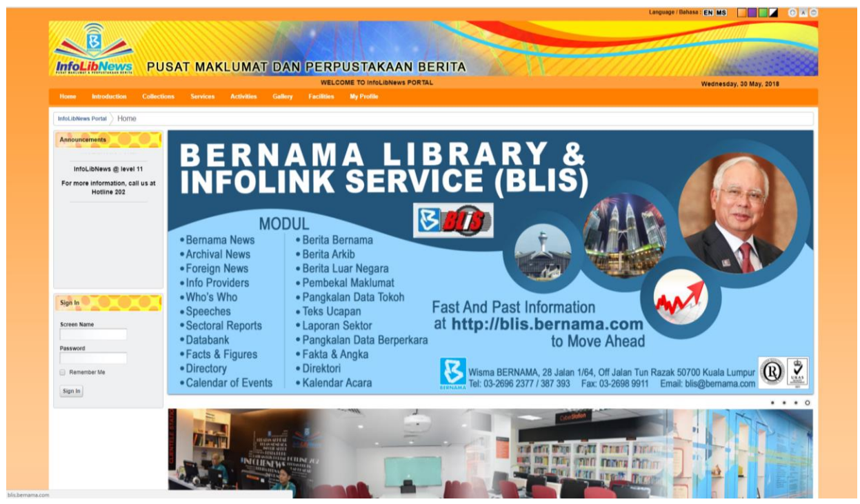
Figure 1: InfoLibNews Portal Main Page

The InfoLibNews Portal which was launched on 22 April 2008 is the access to a collection of reading materials, information, announcements, promotions of services/activities and developments of InfoLibNews. This portal helps users to review the content, book covers and abstracts (if any) of the required books (Webopac); selected articles from magazine (Webinfoline); bound volumes of BERNAMA News (e-book); research topics conducted by BERNAMA (Research); links to selected sites (Links); bulletin (InfoLibNews Alert); gateway to BLIS/BERNAMA/Images/Blog; information about BERNAMA/InfoLibNews; and Newspaper headlines. This can be viewed at http://infolibnews.bernama.com.