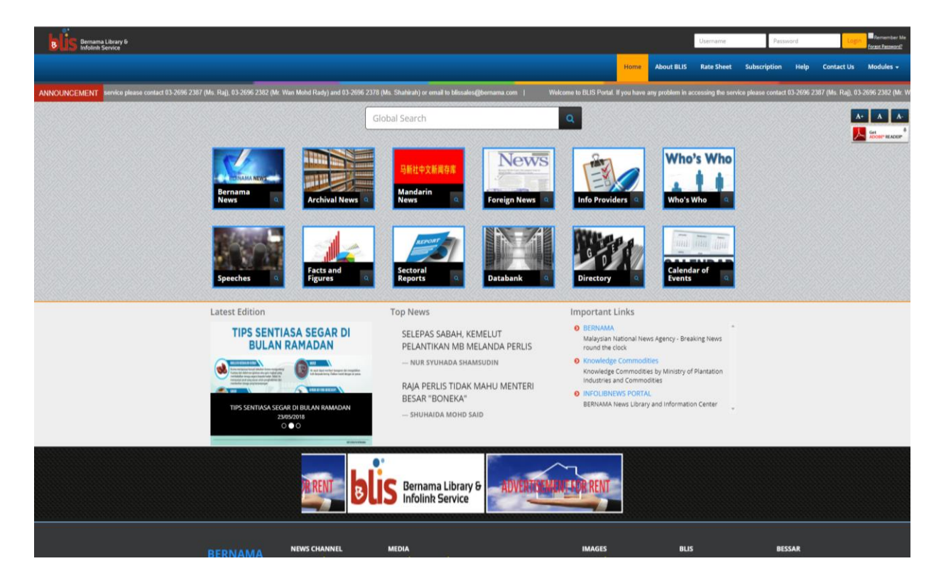
Figure 2: Main Page of BLIS

BLIS operates as an electronic library with easy global access and this makes it an ideal source for news and information about Malaysia. It is jointly owned by InfoLibNews which focuses on the internal users and the Database and Corporate Information Division which focuses on promoting and selling the packaged products to the clients. The contents of the modules are provided by the respective providers and and are also gathered internally from the mainstream newspapers such as Berita Harian, New Straits Times, Utusan Malaysia, The Star, and BERNAMA news. Information are double checked with other sources such as magazines, the Internet, official websites of government/private/related agencies and other regional news agencies, social network, annual reports and other alternative sources of information. As at December 2017, it has 5,902,223 articles. BLIS consists of 12 modules namely BERNAMA News, Archival News, Mandarin News, Foreign News, Info Providers, Who's Who, Speeches, Sectoral Reports, Databank, Facts & Figures, Directory, and Calendar of Events.