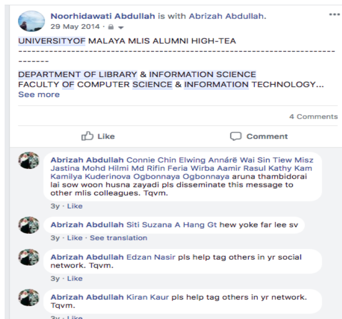
Figure 4: FB Post for Alumni Hight-Tea Event

Tracer study or alumni survey was conducted to trace graduates to improve education programme that better suit the employment requirements. For the purpose of curriculum review and development, FB was used as a platform to broadcast an ALUMNI HIGH-TEA event and gather information on MLIS programme in a tracer study. An example of such activity is shown in Figure 4.