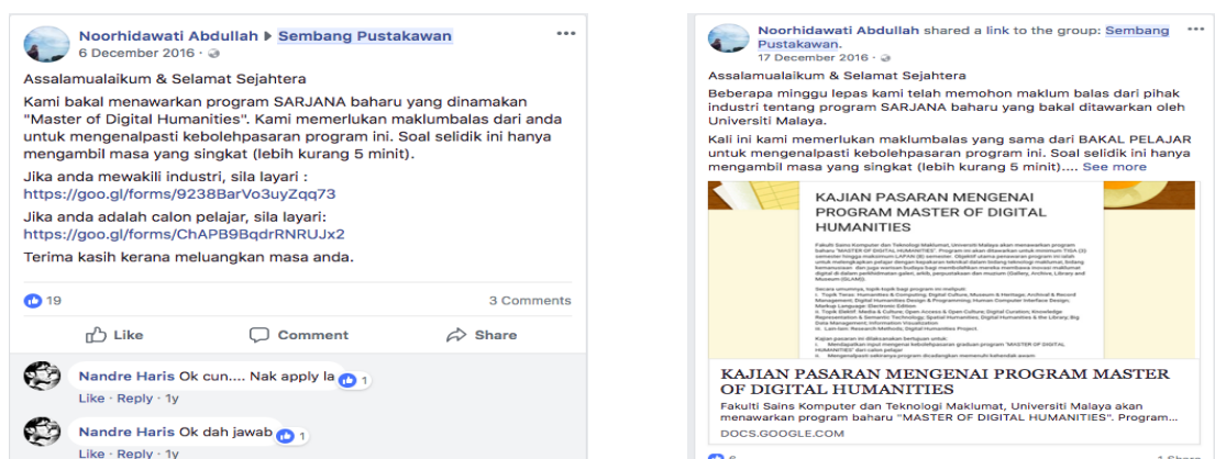
Figure 2: Conducting Market Surveys via Facebook

Social media platform was used as a platform to disseminate market surveys of LIS related programme. Figure 2 shows FB post on market survey conducted to gather feedback on the programme marketability from industry and potential students: