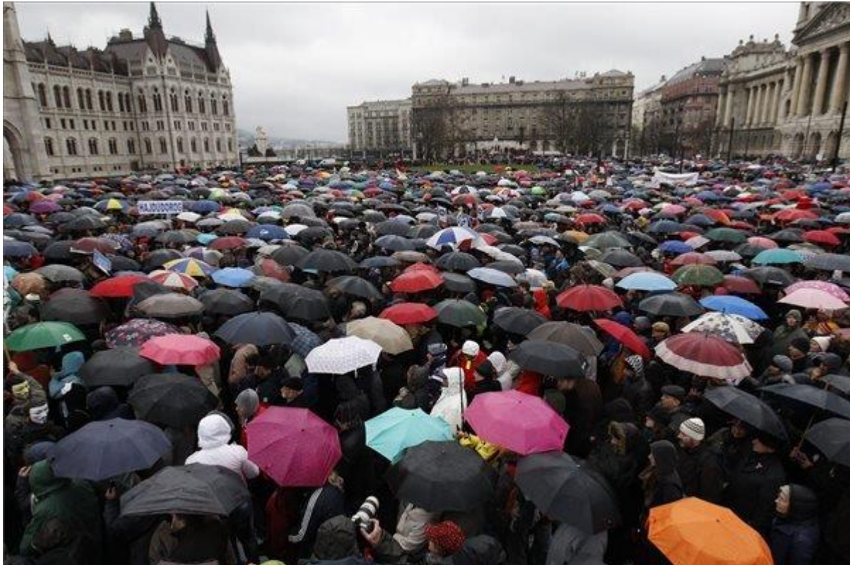
The umbrella protest 13/02/2016

The organizations of teachers, parents and students together with the HSLA supported the movement, who considered the forced centralization in the education harmful for the society. The movement questions the education policy which necessarily involves political relations; therefore the board of the HSLA has asked its members to vote before joining the movement's professional platform called Civil Platform for Public Education (CPPE) of several non-formal civil organizations.