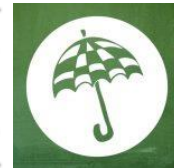
The logo of the CPPE and the IWTM