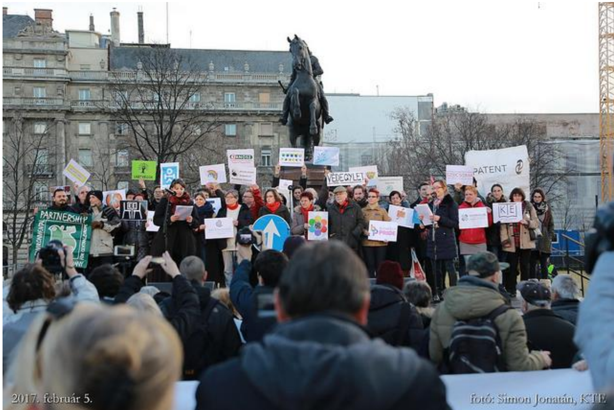
The Civil's Day; Protest against the new civic legislation in front of the Hungarian Parliament, 05/02/2017