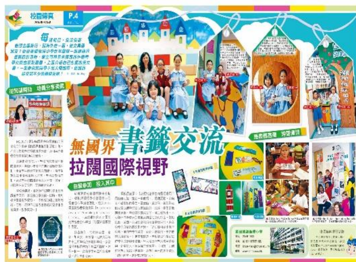
Figure 5. Press Report from the Sing Tao Daily (2014) on the International Bookmark Exchange Project in Hong Kong

In the digital era, the Teacher-Librarian also adopted online videos to promote historical and cultural memories through the Lunar Chinese New Year Project with Tettenhall College of United Kingdom. This project not only benefits students and teachers socially, intellectually and culturally, but also sheds light on further multi-level application of videos and other digital technologies on school library advocacy and education. Looking ahead, the Teacher-Librarian of Lam Tin Methodist Primary School will use e-books as well as audio-books to enhance the Cross-boundary Bookmark Exchange Project. This will encourage students whose English proficiency is not as good as their classmates to participate in this project and, as a result, will help them to enjoy and love reading.