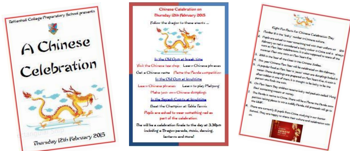
Figure 4. Poster and brochure of Lunar Chinese New Year Celebration at Tettenhall College

From the videos, it is amazed to see the difference and similarities in celebrating the Lunar Chinese New Year: Hong Kong students emphasized on preserving the legend of Monster Nien in Lunar Chinese New Year while the United Kingdom students were interested in the stories of the Jade Emperor and the Chinese Zodiac. Students in both places recognized the red color is the lucky color and number eight is the lucky number in Chinese culture. They also realized that the customs of eating glutinous rice dumplings in sweet soup, visiting friends and relatives, watching dragon and lion dances are common activities for the celebration of the joyous festival.