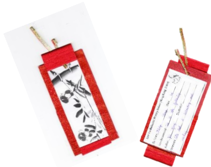
Figure 3. A Student's Bookmark of Lam Tin Methodist Primary School

From student's perspective, they can understand the customs and traditions of different countries through the Campus TV. The Teacher-Librarian and the Student Reading Ambassadors of the Library researched the background of the partner schools and countries before introducing the Project on the Campus TV. All students are able to recognize the national emblem, flag, geographical location, customs, and basic demographics of different countries through the Project. They are especially interested in viewing YouTube videos of other countries such as folk dances and rituals of festival celebration. Furthermore, the origin of the International Bookmark Exchange Project, the ISLM and its annual theme will also be introduced on the Campus TV as well.