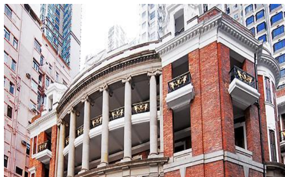
Figure 4. Dr Sun Yat-sen Museum

Different from the Ping Shan Tang Clan Heritage Trail, the Central and Western Heritage Trail is located on the northern coast of Hong Kong Island. The entire trail comprises three routes. They are the Central Route, the Sheung Wan Route, and also the Western District and the Peak Route. In this project, the focus was on the Sheung Wan Route as Dr Sun Yat-sen, the "Father of the Nation", was educated, baptized and did the planning of his revolution with comrades in this area. The Dr Sun Yat-sen Museum is located on the Sun Yat-sen Historical Trail. It acts as an important part of the Sheung Wan Route, which was set up by the Central and Western District Council. Buildings of different religions, traditional Chinese buildings, tea houses, and historic sites are found in this place. Fifteen out of thirty-five historic buildings and sites were selected for the study of the Primary Three students along the trail. All those remarkable buildings and sites reflect the growth of the city and witness its development over the years.