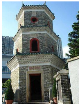
Figure 3. "The Pagoda of Gathering Stars" of the Ping Shan Heritage Trail (Source: Declared Monuments of Hong Kong, 2017).

the Ping Shan Tang Clan Gallery and the Heritage Trail Visitor Centre. Tsui Sing Lau (聚星樓) can be claimed to be the most important declared monument of the trail as it is Hong Kong's only ancient pagoda. The pagoda's name in Chinese means "Pagoda of Gathering Stars". It was built more than 600 years ago according to the genealogy of the Tang clan of Ping Shan. Many people believe that the pagoda was originally seven-storey high. It was due to a strong typhoon which damaged the pagoda that only three storeys remain today. The pagoda was built to improve the feng shui of the area. The villagers believed that flooding disasters were prevented and clan members could pass the Imperial Civil Service Examinations with the blessings from this special building. In fact, according to the record of the Education Bureau, the Tang Clan of Ping Shan did produce numerous scholars and officials (Education and Manpower Bureau, n.d.).