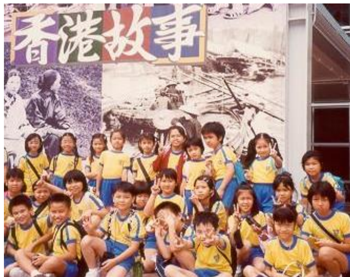
Figure 2. Hong Kong Museum of History Visit

Students were guided to respect the unique culture and historical development of Hong Kong, so as to enhance their sense of belonging to the SAR and to China in this collaborative project. Diversified educational programs were provided such as Historical and Genealogical Collections Exhibition, monument tours of the heritage trails in three regions of Hong Kong, information literacy skills workshops, etc. In addition, the staff of the Hong Kong Museum of History was invited to deliver a talk at school. They shared with students many interesting stories of the ancient historic events in Hong Kong. All these activities articulated a clear picture in the students’ mind that Hong Kong is an indivisible part of China.