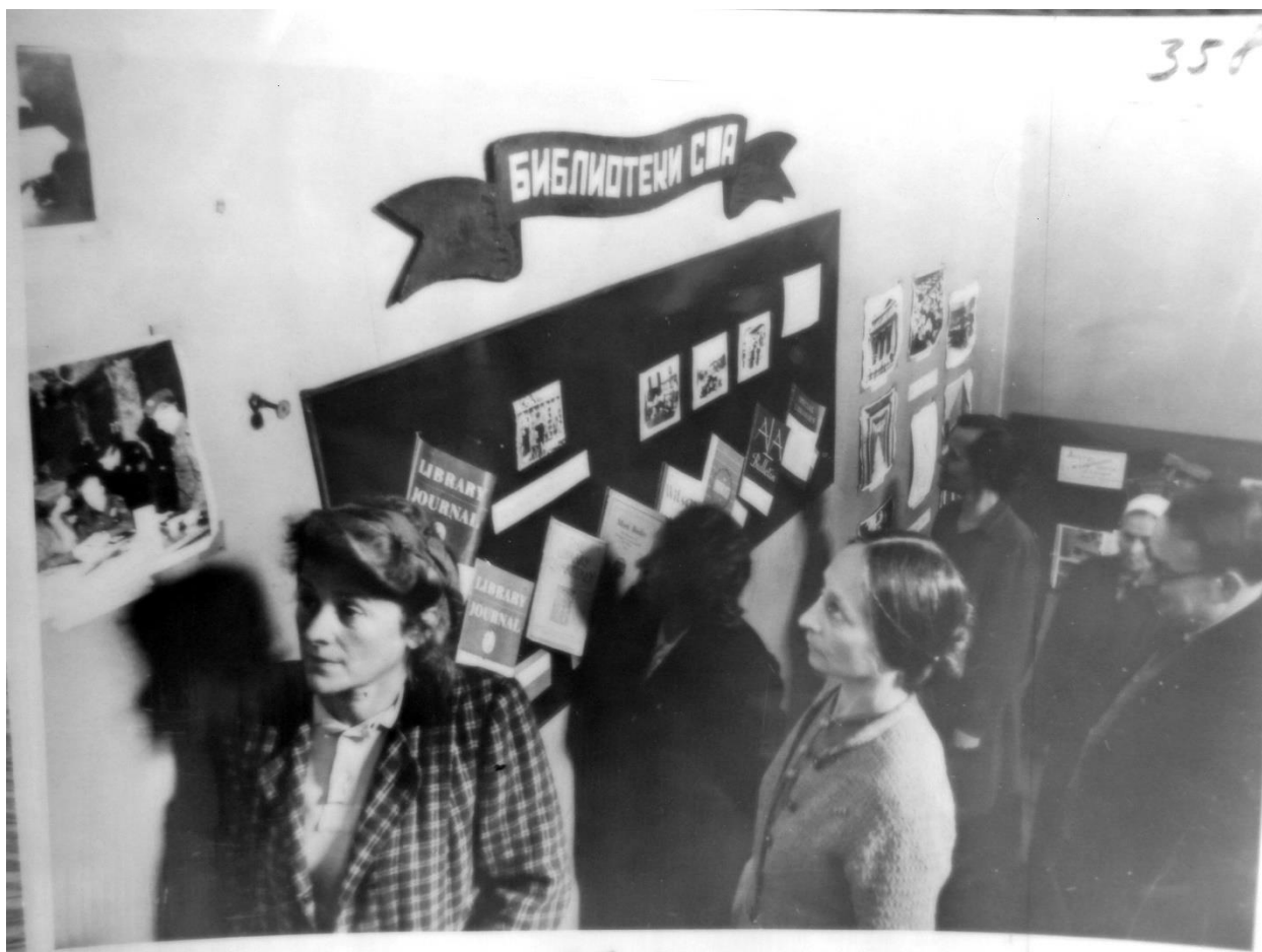
Figure 2. An exhibit of American library practice held at the Soviet State Library for Foreign Literature in December, 1945 (today's M. I. Rudomino All-Russian State Library for Foreign Literature, Moscow).