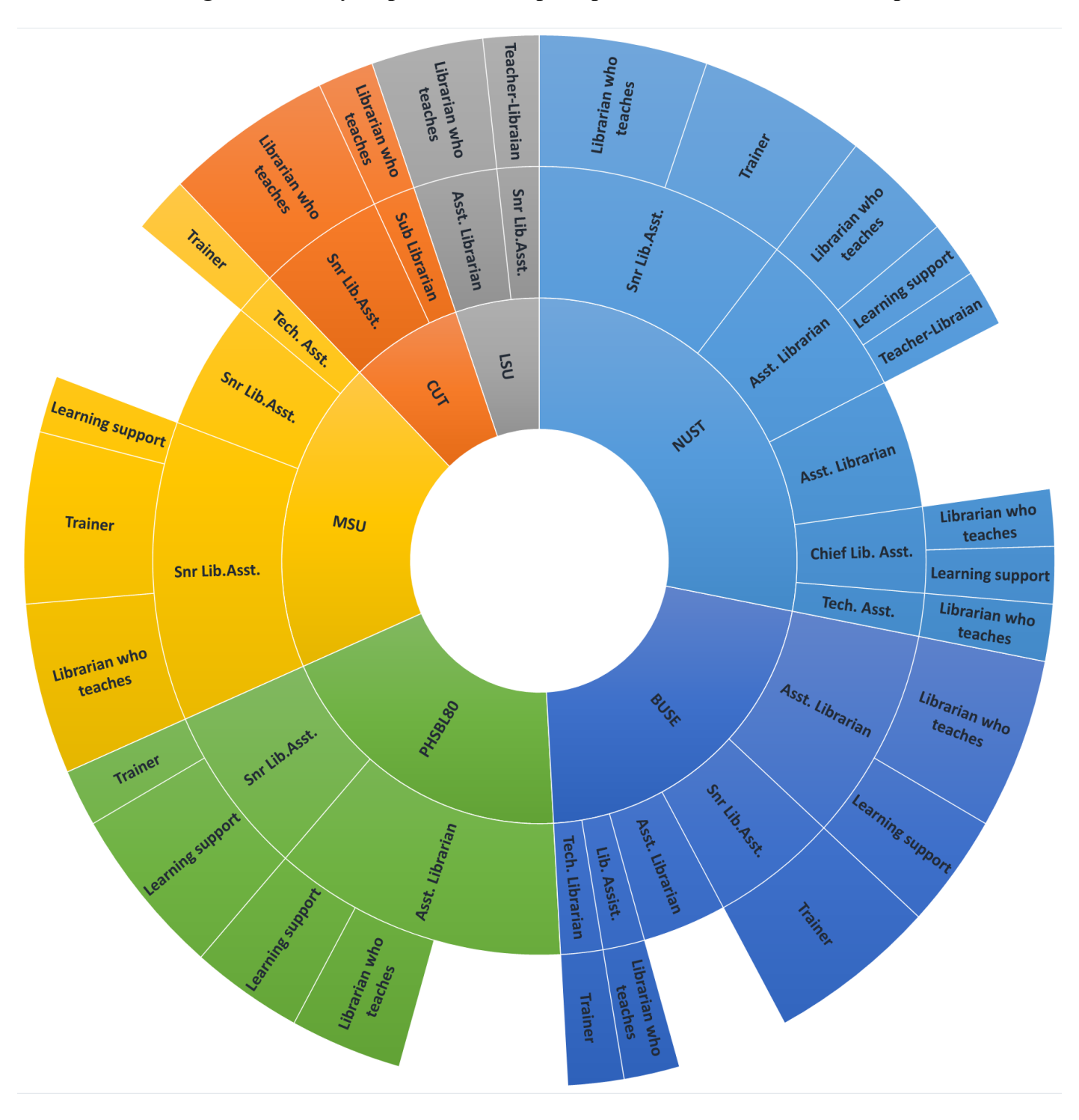
Figure 2: Survey respondents' self-perceptions in blended librarianship

From the results of the survey pointed out in Figure 2 , it can be recognized that most of the respondents in the survey see themselves in terms of Mckinney and Wheeler's (2015) categorisation of academic librarians' perception of their teaching roles as a "Librarian who teaches".