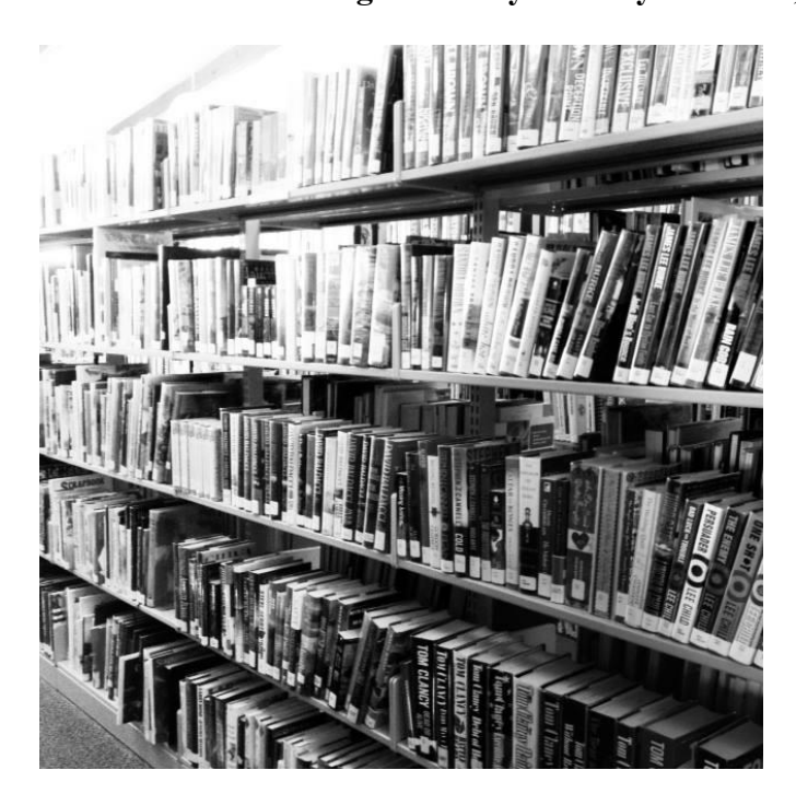
Figure 7: Books on the Amargosa Valley Library's shelves, 2017