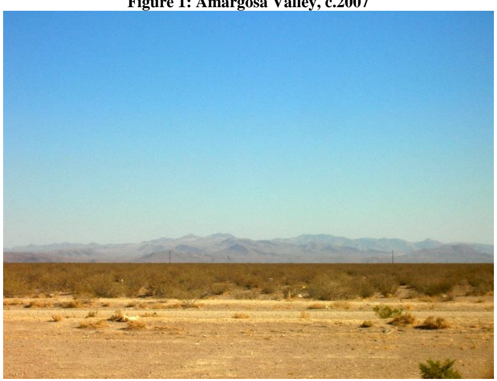
Figure 1: Amargosa Valley, c.2007

Although there is evidence of human activity in the area going back at least 1000 years (McCracken, 1990), settlement in Amargosa Valley has always been sparse at best. Even today, barely 1,500 people live scattered within the town's 1,400+ square kilometers. At the time of the 1970 United States Census, the community - then known as Lathrop Wells - had fewer than 1,000 residents, and as such, did not even meet the population threshold for its own listing in the census results (U.S. Dept. of Commerce, 1973). The few people who lived in Amargosa Valley at that time were largely employed in clay and borate mining, farming of alfalfa and other crops, or government work at the nearby Nevada Test Site (McCracken, 1990). Farming and clay mining continue today, supplemented by a dairy, and work related to Death Valley National Park (the Devils Hole unit of which is within the town boundaries) and Ash Meadows National Wildlife Refuge (which is entirely contained within the town).