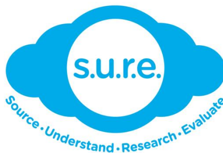
Figure 3: S.U.R.E Campaign Posters