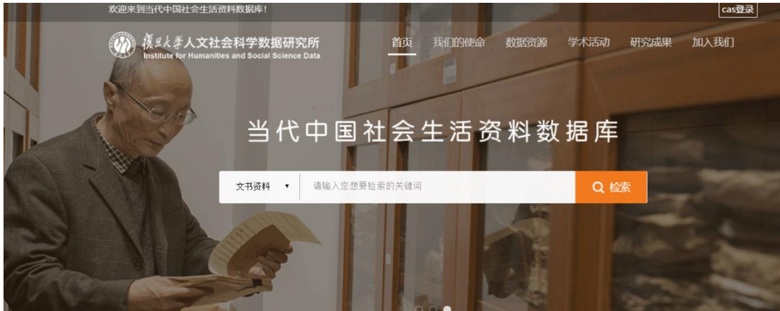
The Contemporary Chinese Social Life Data Platform established by Fudan