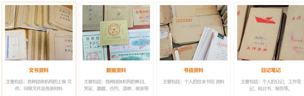
The Contemporary Chinese Social Life Resources collected by Fudan

Next the coalition will focus on sharing private letters whose owners had been marginalized for a long period of time. Fudan library will further upgrade the contents and multilingual pages, as well as digital database construction so as to serve scholars all over the world. It will contribute to the development of history, sociology, politics, anthropology and other disciplines. Of course, we are also equipped with legal experts to deal with correspondence-related issues with the relevant laws of China and the international community.