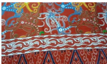
Figure 6: Batik Dayak motifs

The typical Batik Dayak in West Kalimantan is also known as Batik Pontianak. The batik motifs of West Kalimantan are also influenced by ethnic Malay pattern. Their designs are full of lively elements and bright colors. The patterns found in many Dayak motifs of West Kalimantan are usually the pattern of Arowana fish and flower pattern.