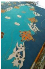
Figure 5 : Batik Tinungkusan motifs

Tinungkusan means heritage, the motifs in Batik Tinungkusan reflects the Kadazandusun, Murut and Rungus ethnic groups identities. The tinungkusan batik is popularly used during the Harvest Day celebration for Unduk Ngadau beauty pageant contestants in Sabah.