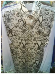
Figure 2: Batik Orang Ulu motifs

Orang Ulu is one of native tribes in Sarawak that living in Northern Sarawak. The motifs refer to carved hook (Kalong Kelawit-lawit) of plants, where the carving has a shape like a plant linkage that can be used or linked to any part of the motifs.