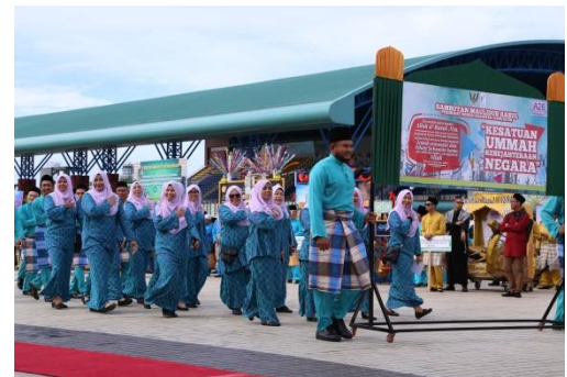
Figure 10 : Batik in Formal Parade

Wearing Batik for parade such as religious procession.