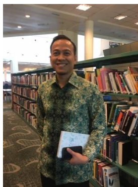
Figure 11: Batik for work

Batik is also suitable for library staff at their workplace.