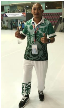
Figure 7: Batik For Sports

One of Sarawak State Library staff wearing Batik sports attire with Sarawak Orang Ulu motive at Sukan Perpustakaan Awam Se-Malaysia (SPASM) 2017 in Kuala Lumpur.