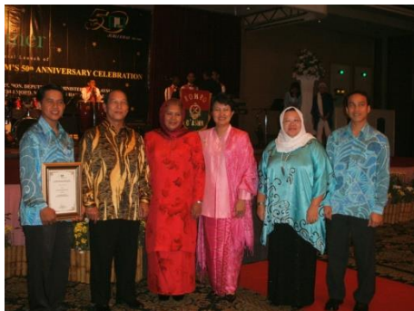
Figure 9: Batik for formal events

Wearing Batik for formal events or functions such as award presentations.