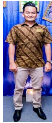
Figure 8: Batik for Dinner

One of Sarawak State Library staff wearing Batik for Annual Dinner event.