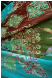
Figure 4: Batik Linaudsilad motifs

Motifs Linaulau is from Murut ethnic group in sabah. Murut is the second largest indigenous people in Sabah. Linaudsilad refers to plant elements, and then silad is a big size of leaf that can be used for medical purpose. (Ismail, 2007)