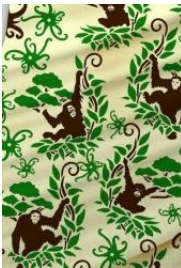
Figure 3: Batik Orang Utan motifs

Based on Oxford dictionaries (2018), The Orangutans can be found both in the islands of Borneo and Sumatra. From the uniqueness of Orangutans, Sabahan adapt the element of the Orang Utan into their Batik design.