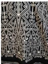
Figure 1: Puak Kumbu motifs in Batik Borneo

Based on Augustine (2001), "Pua Kumbu is ritual clothes or blankets of various types and importance woven by Iban Ladies". Recently, the design was famous among Malaysian and most of local designer takes the opportunity to adapt the motifs into batik.