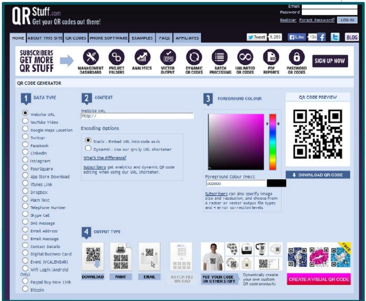
Free QR code generator accessed at http://www.qrstuff.com/index.html

The URL was converted to a QR code shown below and the code was saved to a section computer and later included in the design and printing of a poster that was displayed all over the constituencies to be accessed using phones or tablets and other mobile devices months before the polling date. This supported eligible voters to be in the correct line by 7:00am as required by the law.