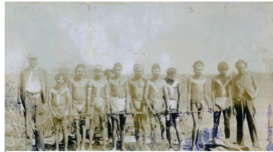
Figure 2: Photograph of Aboriginal boys getting ready for a Corroboree (celebration). Identified by the original donor as simply 'Blacks, W.A'. (SLWA BA1823/36)

The State Library of Western Australia houses a significant collection of heritage materials including around 1,000,000 images. These images have been donated or acquired over the 125 year history of the library and are housed in the Alexander Library Building in Perth, Western Australia. Out of these thousands of photographic collections only a very small handful were donated by Indigenous people or organisations (estimated at less than 1 percent). Instead, the visual histories of stations, missions and communities have been documented by station owners, missionaries and anthropologists with little or no consultation of the Indigenous peoples and cultures depicted in the images ( figure 2 ).