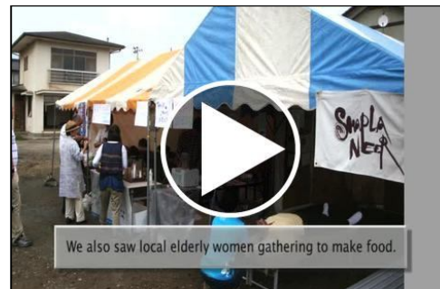
Figure 3 Record of aid activities by private organizations such as NGOs, NPOs, and volunteer groups (Video) (“The Great East Japan Earthquake and Japanese NGOs : From emergency relief to reconstruction? A turning point for the future” produced by an authorized nonprofit organization, the Japan NGO Center for International Cooperation, financed and cooperated by the Global Citizen Foundation)