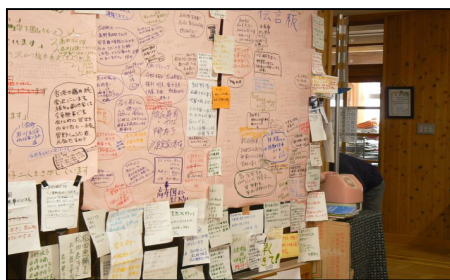
Figure 4 The shelter in Rikuzentakata city Daiichi Junior High School

The records of the Great East Japan Earthquake are in paper form and digital form. In regard to paper form records, the holder including the NDL should carefully preserve them depending on their nature. The handwritten record is one of the records which each organization is anxious about handling. People of the affected areas handwrote various guides on paper including the backing paper of a poster etc. because of the absence of electricity immediately after the earthquake.