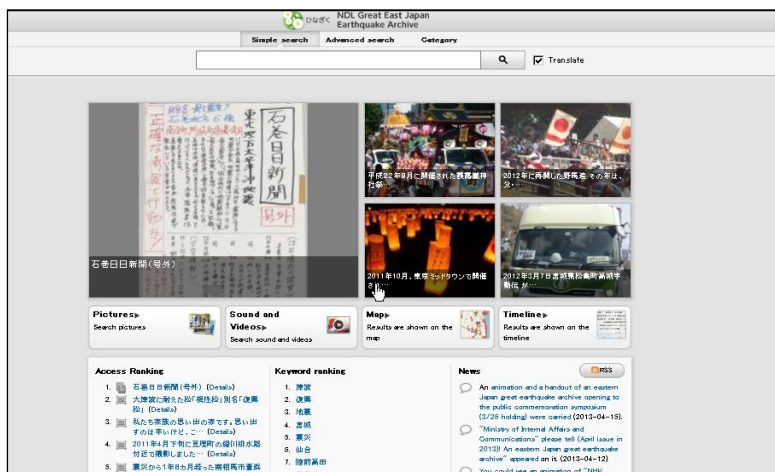
Figure 1 Top page of the Great East Japan Earthquake Archive (HINAGIKU) (English version)