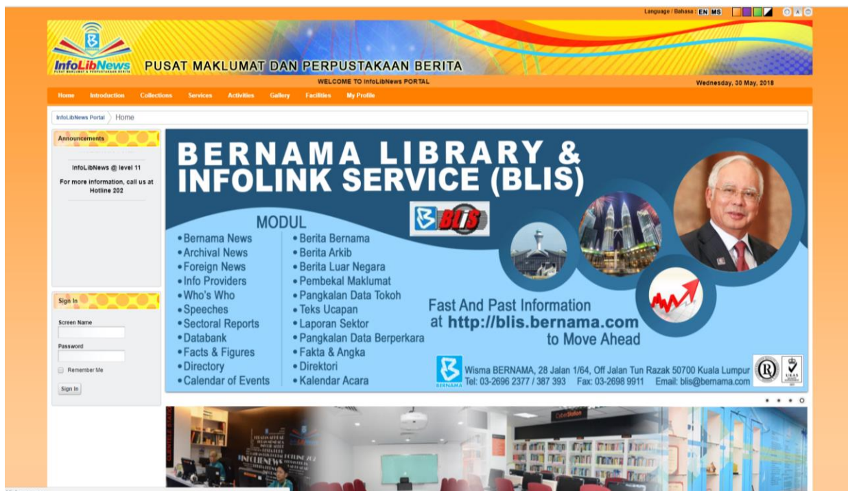
Figure 1: InfoLibNews Portal Main Page

The InfoLibNews Portal which was launched on 22 April 2008 is the access to a collection of reading materials, information, announcements, promotions of services/activities and developments of InfoLibNews. This portal helps users to review the content, book covers and abstracts (if any) of the required books (Webopac); selected articles from magazine (Webinfoline); bound volumes of BERNAMA News (e-book); research topics conducted by BERNAMA (Research); links to selected sites (Links); bulletin (InfoLibNews Alert); gateway to BLIS/BERNAMA/Images/Blog; information about BERNAMA/InfoLibNews; and Newspaper headlines. This can be viewed at http://infolibnews.bernama.com .