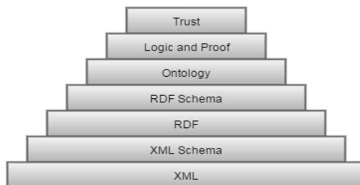
Figure 1 Semantic languages layered cake

Ontologies are the main model for knowledge representation in the Semantic Web. Ontologies describe the entities that consist of a set of types, properties, and relationships. Ontologies are expressed in the Semantic Web language defined by the W3C committee, which consists of the Resource description framework (RDF), Resource Description Framework schema (RDFS), and Web Ontology Language (OWL). They are all used to define ontologies with different level of semantics. Researchers in [5] have found that ontologies are the ideal knowledge model to formally describe web resources and their vocabulary, and hence, to make the underlying meaning of terms included in web pages explicit. The focus here is not on the specification and the syntax of each language, but on the differences of the semantic capabilities of each one relative to others, and its role in creating a semantic model for a given domain. In the Semantic Web literature, the languages and the reasoning technologies have always been arranged as a stack called the layered cake.