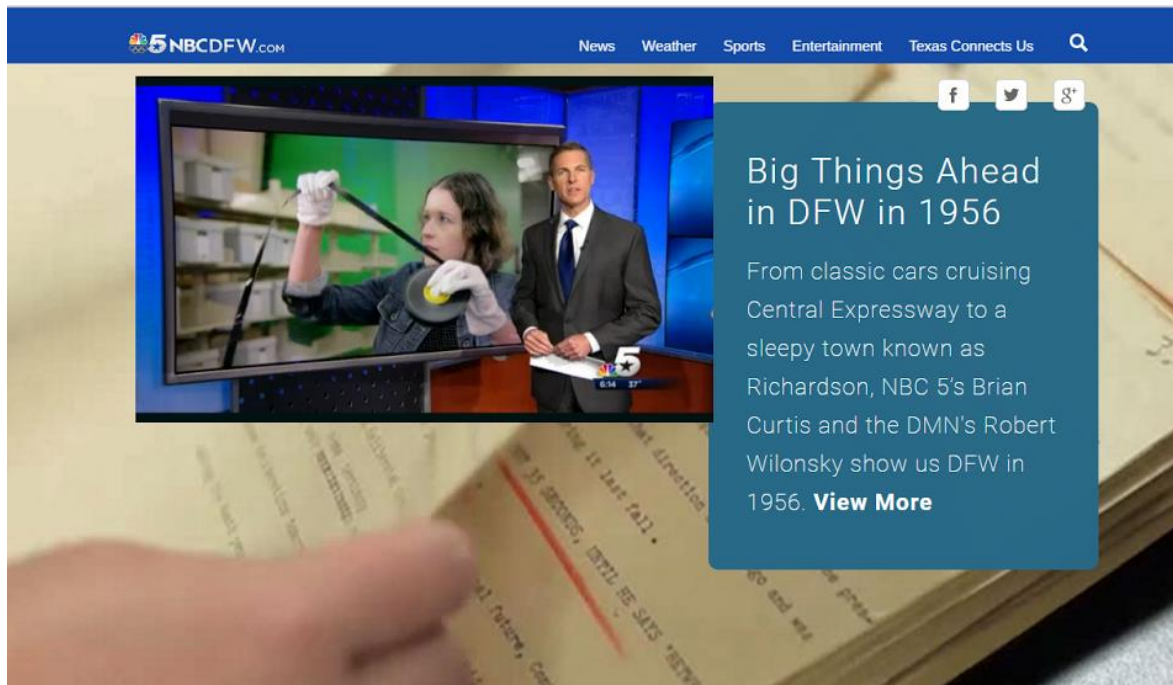
Figure 1: Screen capture from NBC 5/KXAS Archive Promotion Website

In addition to the promotional segments aired during the evening news, NBC 5 invited the Head of Special Collections and Dean of Libraries to be guests on their Saturday morning public-affairs television talk-show. NBC 5/KXAS also sent crew members to UNT to create a four minute “sizzle reel” which introduces the archive project, our goals, and the cooperative partnership established between the two institutions. This “sizzle reel” is an easy way to get people interested in the collection, and can easily be shared from our website and social media pages.